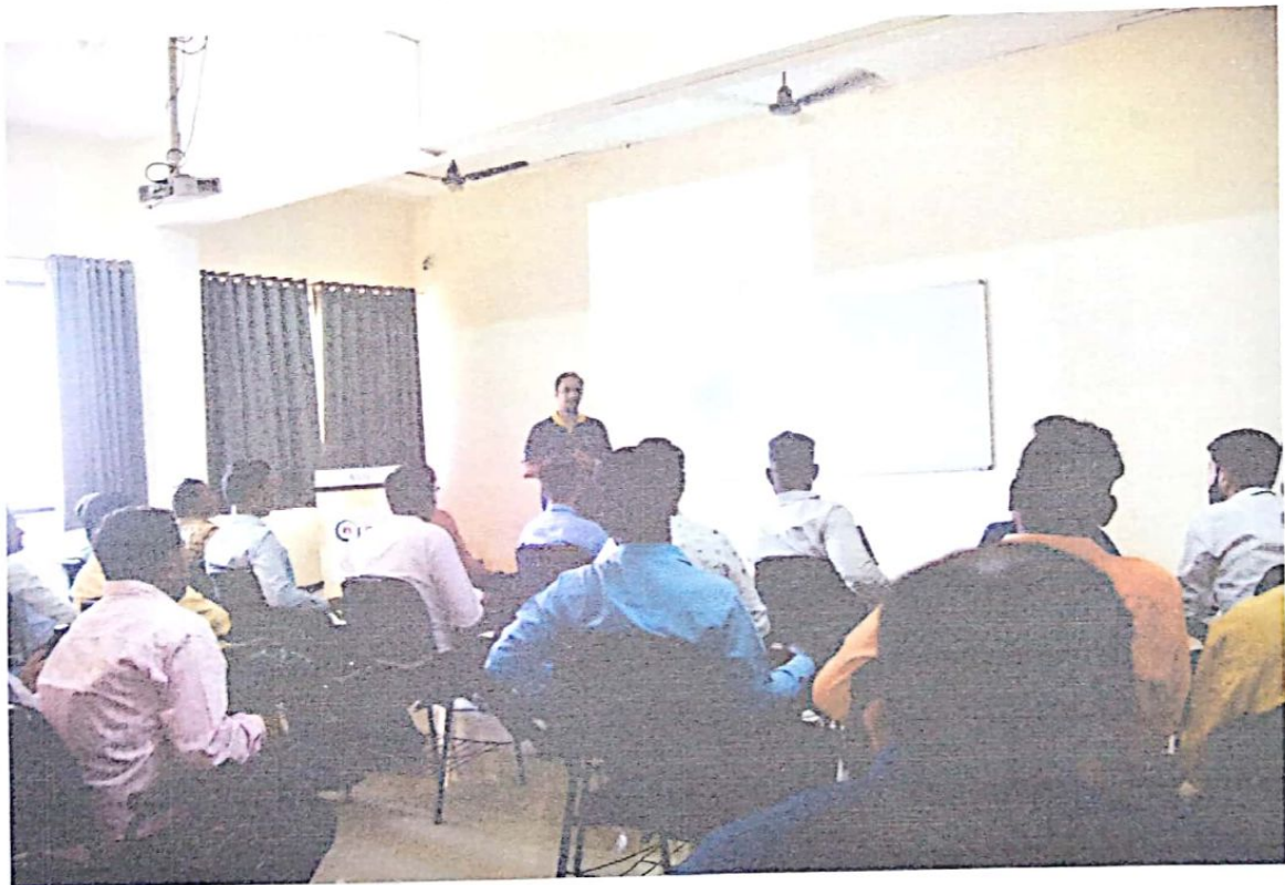
Snap of Workshop during the session