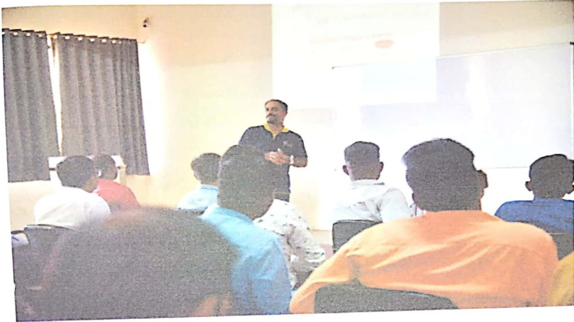
Snap of Workshop during the session