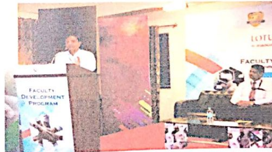
Snap of Other sessions & Group Photo