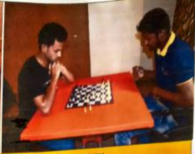
Cultural Night and Prize Distribution Ceremony