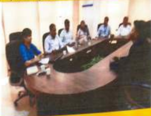
LPL Performance Check