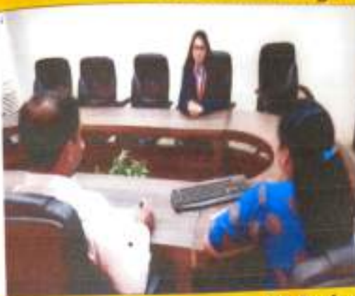
Lotus Premier League (LPL) Managers Interview